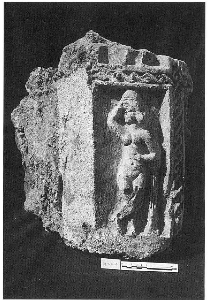
Fig. 35. Cat. no. 115. Half-column with reliefs from Qaleh-i Yazdigird.