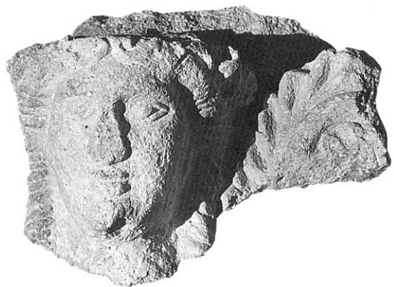
Fig. 33. Cat. no. 106. Figural capital from Qaleh-i Yazdigird.