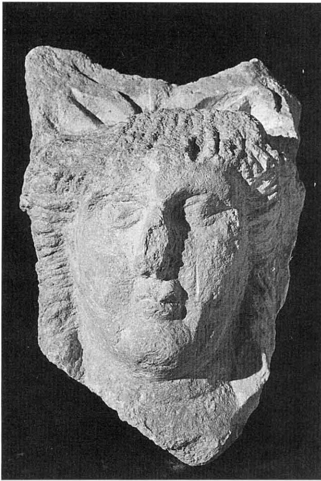
Fig. 34. Cat. no. 110. Figural capital from Qaleh-i Yazdigird (photograph by courtesy of E.J. Keall).