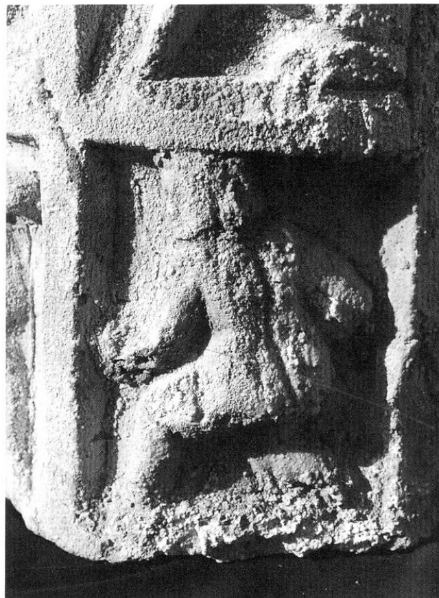
Fig. 36. Cat. no. 116. Half-column with reliefs from Qaleh-i Yazdigird.